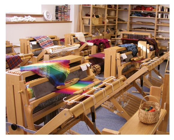
The classroom is equipped with over thirty looms—all pre-warped and ready for sample weaving.

Morning lectures are followed by afternoons at the looms weaving samples that illustrate the lessons. Students take home a complete handbook of indepth information and many woven examples.