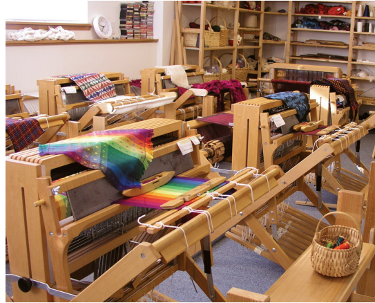
The classroom is equipped with over thirty looms—all pre-warped and ready for sample weaving.

Morning lectures are followed by afternoons at the looms weaving samples that illustrate the lessons. Students take home a complete handbook of in-depth information and many woven examples.